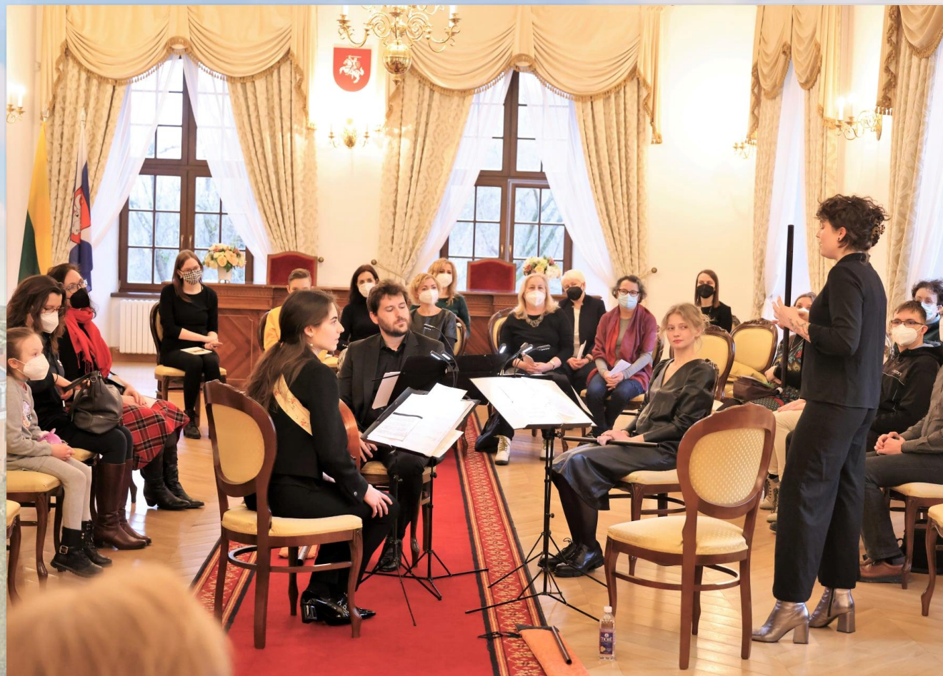
Concert “The King’s Flutes: Early Tudor Court Music”