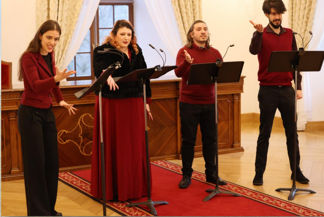
Concert “In Amoroso Foco”