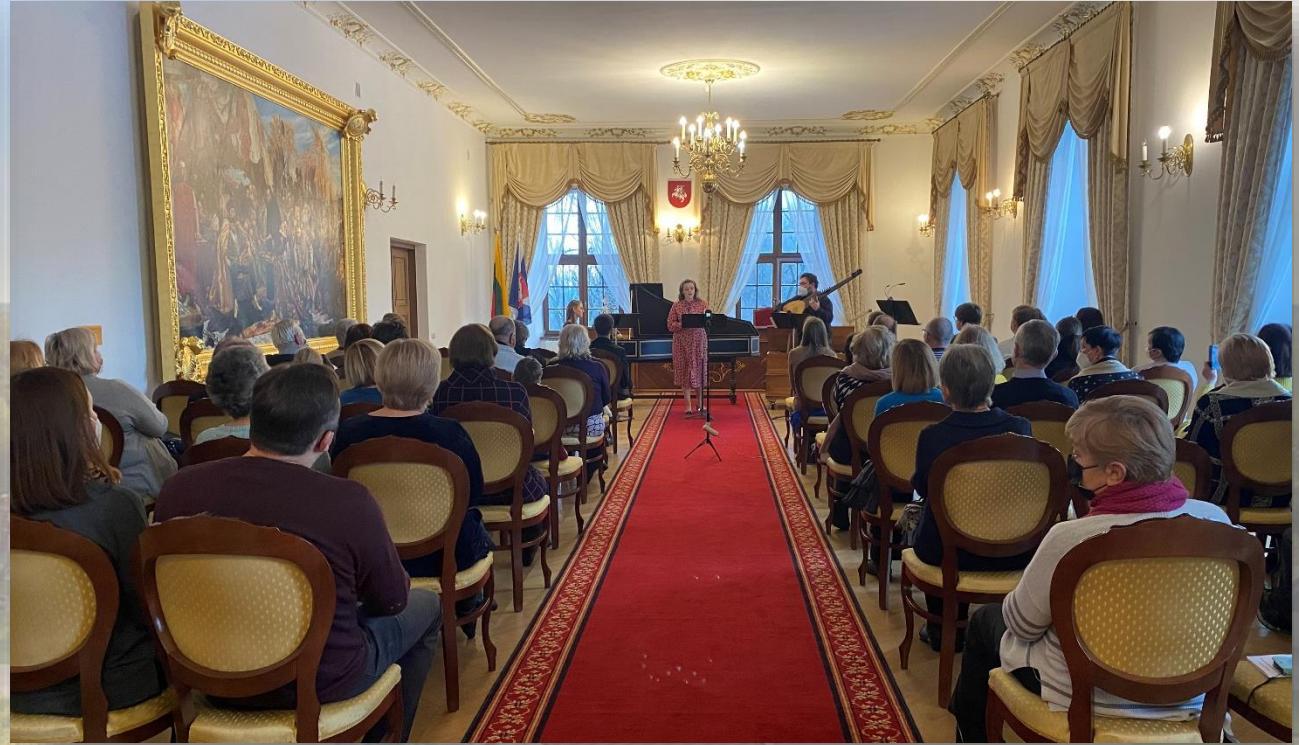
Concert “Music and poetry songs in art”