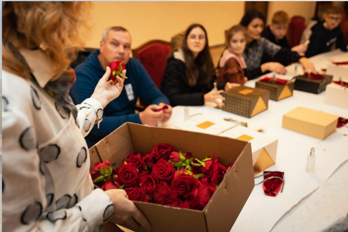
“Baltic treasure” workshop